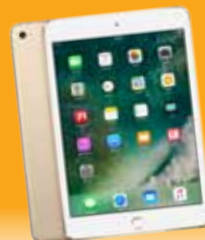
APPLE IPAD MINI